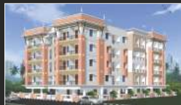
Poonam Jayadev V.T. Road, Mangalore