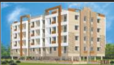
Poonam Park Bejai-Kapikad